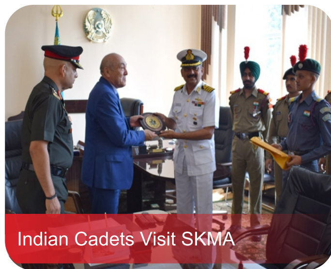
Indian Cadets Visit SKMA