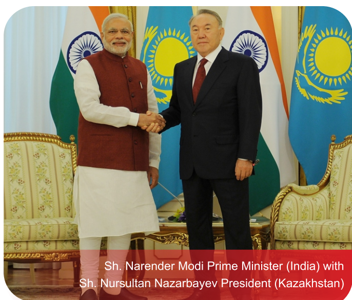
Sh. Narendra Modi Prime Minister (India) with Sh. Nursultan Nazarbayev President (Kazakhstan)